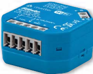
ESB64NP-IPM with adapter EOA64