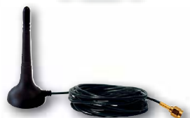
including an external EnOcean antenna FA250